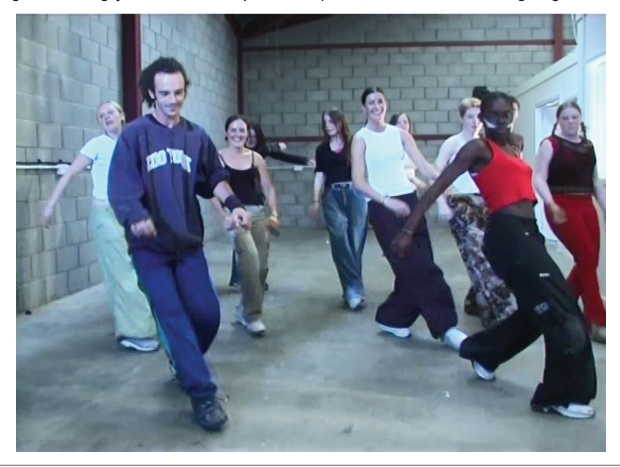
Figure 4. The Fogeyfication Centre escape dance sequence

grey trousers that are held up by braces, covering his oversized, stuffed belly. On the other hand, the Boogieman and her fellow outlaws are wearing T-shirts and cargo pants more appropriate to their age group. Needless to say, the Young Fogeys are clothed in oversized Harris Tweed waistcoats and jackets, neckties and flat caps. In short, the conflict between the generations is fought on the cultural grounds of music, fashion and dance. The previously imprisoned outlaws emerge victorious from this stand-off, and secure their freedom from the monocultural oppression that had been inflicted upon them up until this point. They celebrate their liberation by continuing the party on Aberdeen beach, the Duke of York dancing ecstatically at the centre of the crowd, as they clap along to the dance music. An edit to the cabbages being discarded, as the waves pull them out to sea, puts a full stop on the reign of the Crofter and his 'Kailyard'-inspired ideals. In the final shot, the camera zooms in and out on the planet, but the image of the dreary potato has been replaced by the glittery facade of a disco ball.