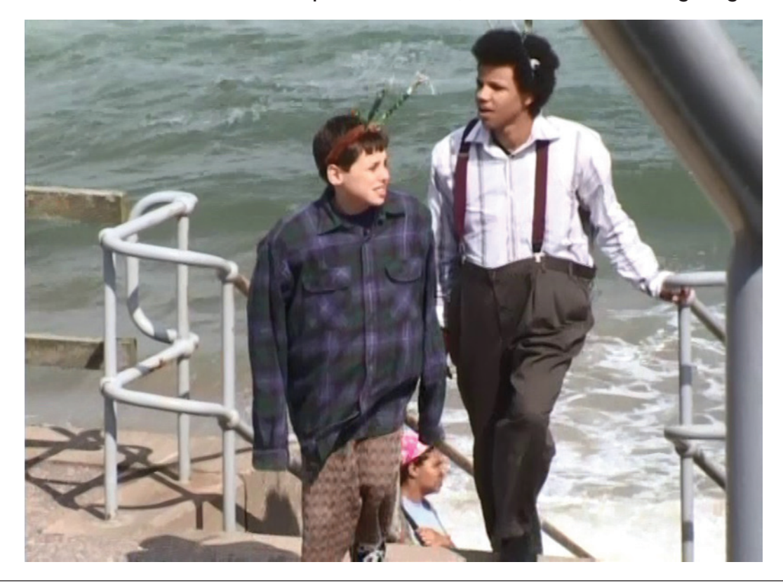
Figure 2. Tubor and the Duke of York explore Aberdeen

They find the Northern Lights, which is actually the name of a cinema. These scenes were filmed in the Belmont Cinema. The aliens are mistaken for Young Fogeys, and an outlaw film buff in the audience proclaims, 'You can take our freedom fogeys, but you'll never take our films' – a reworking of the famous line from Braveheart (Mel Gibson, 1995). Tubor subsequently manages to defeat them with his kung fu moves. One outlaw girl explains to the two aliens that: