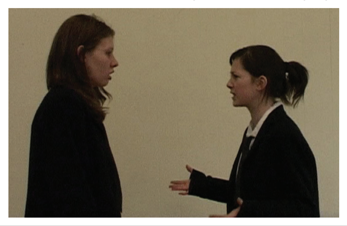
Figure 1. Visual recreation of a shot from Reservoir Dogs

Like the scene in Reservoir Dogs , the characters subsequently have a physical altercation: after pushing each other, Mr Pink falls to the floor and Mr White starts kicking him, before both draw their guns. There is a point-of-view shot from Mr Pink's perspective, which replicates the one in Tarantino's film, before cutting to a wide shot. Mr White says, 'Violent movies don't affect teenagers', and Mr Pink shouts back, 'Yes, they do!' The camera slowly retreats from this stand-off until a third character can be seen. Now we see the back of Mr Blonde, played by a teenage boy. While in the original, Michael Madsen's Mr Blonde held a paper cup from a fast-food restaurant, here Mr Blonde is holding a soft-drink bottle. He takes a